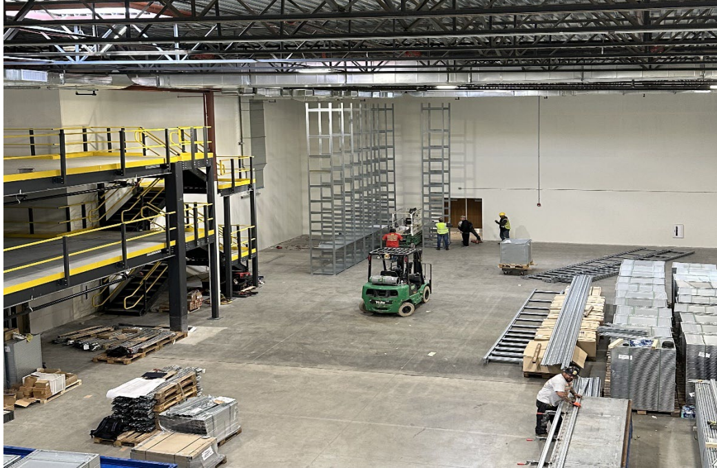
The McMurtrey Avenue Property Facility