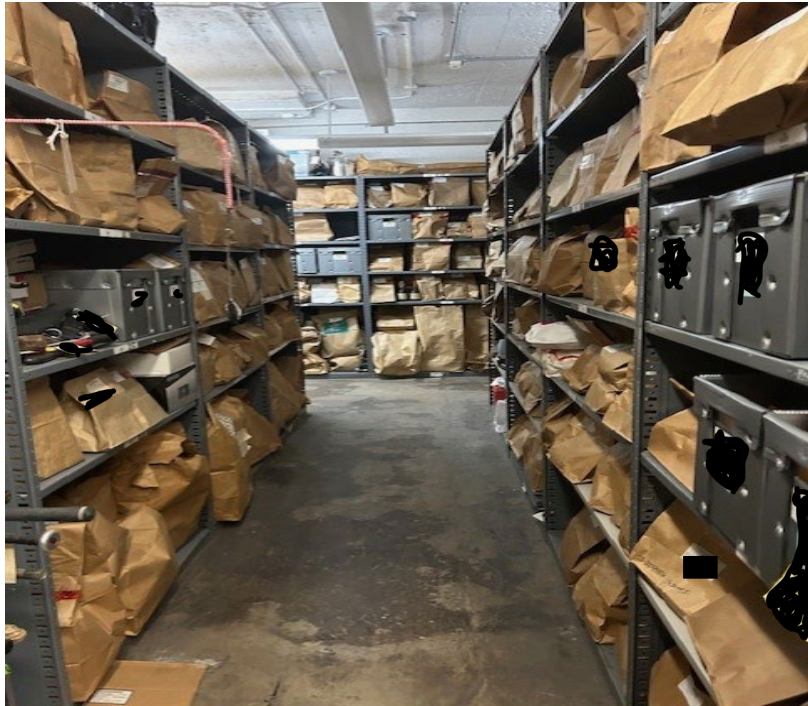
Basement rack system for homicide evidence at the L Street Property Facility