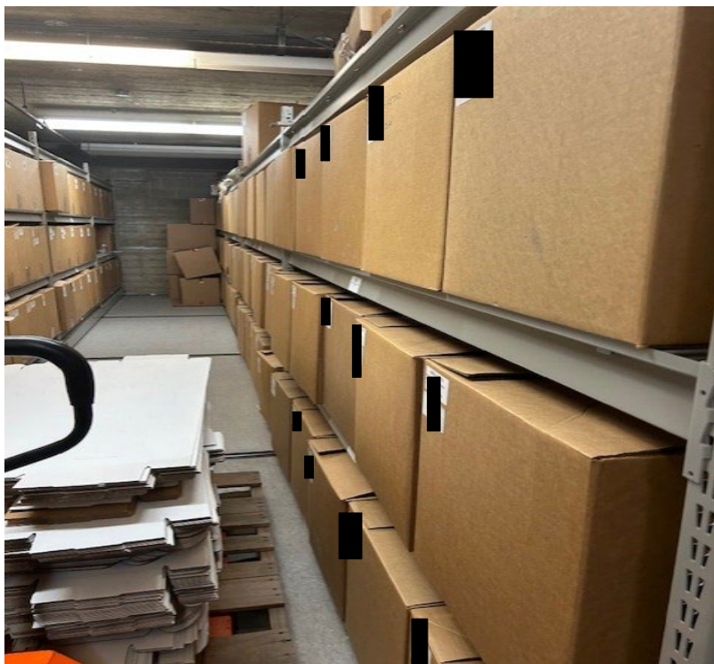
Miscellaneous boxes stored at the L Street Property Facility