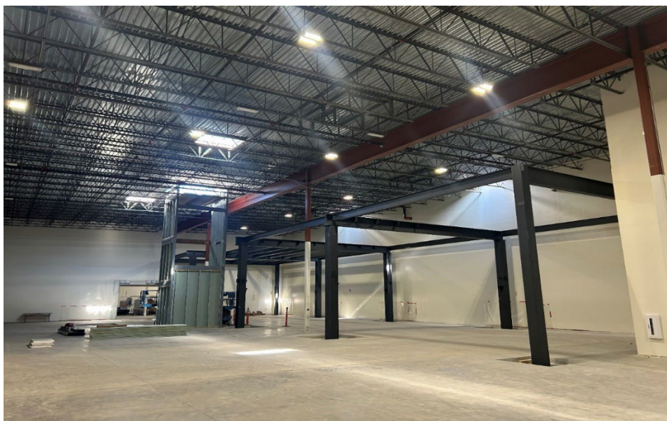
The McMurtrey Avenue Property Facility