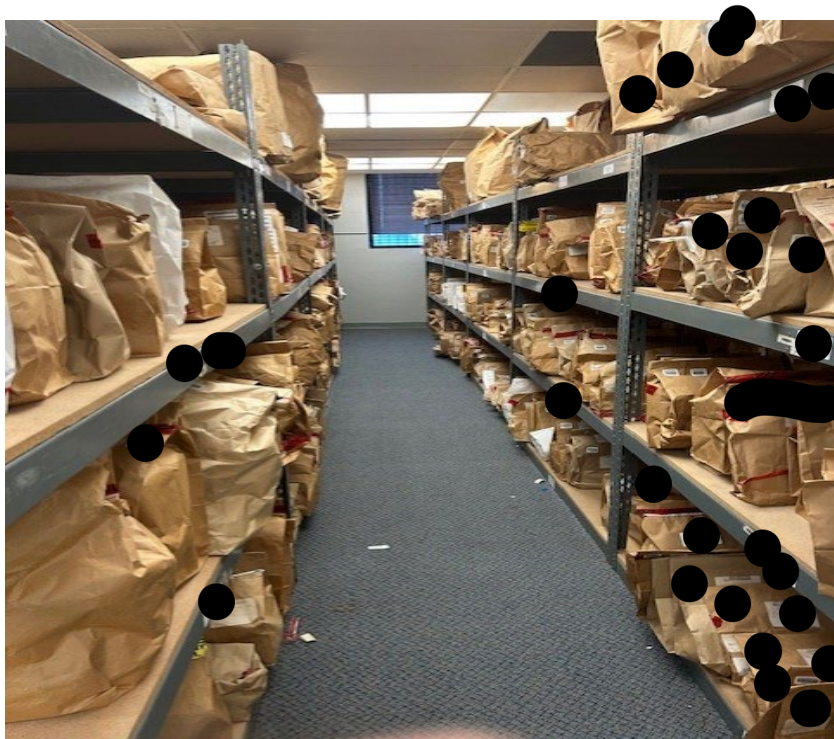
Sexual assault storage area at the L Street Property Facility